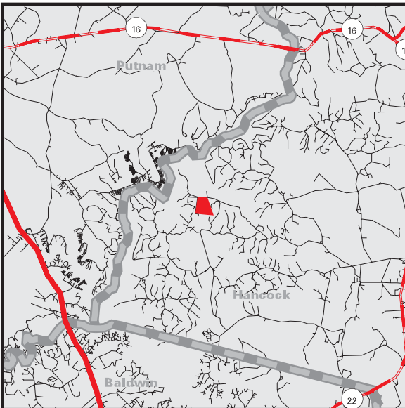
LOCATION MAP scale 1 inch = 5 miles